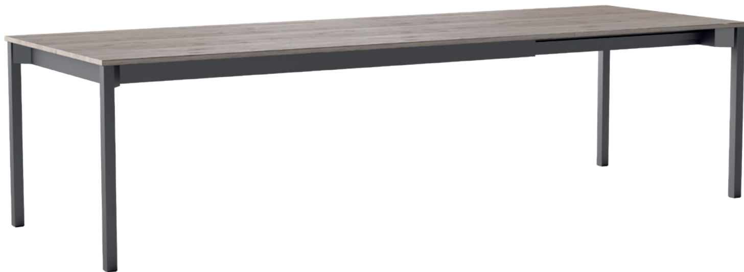
T Cabrio ht75 210U ep79 HP77