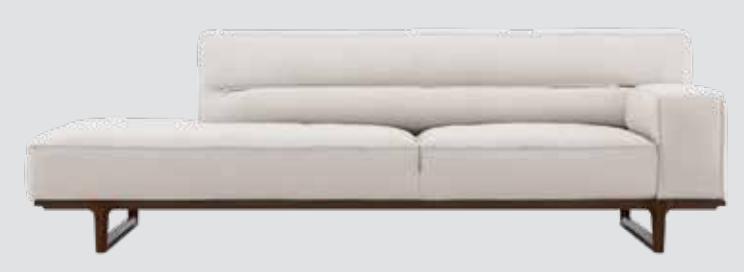
Sofa with end unit H77 - W104 - D242 cm H30 - W41 - D95"