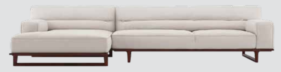
Chaise sofa H77 - W342 - D168 cm H30 - W165 - D66"