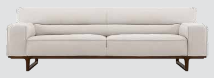
Three-seater sofa H77 - W242 - D 104 cm H 30 - W95 - D41"