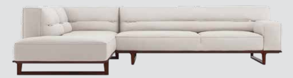
Sectional with end unit H77 - W322 - D242 cm H30 - W127 - D95"