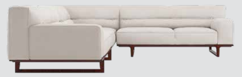
Sectional H77 - W278 - D327 cm H30 - W109 - D129"